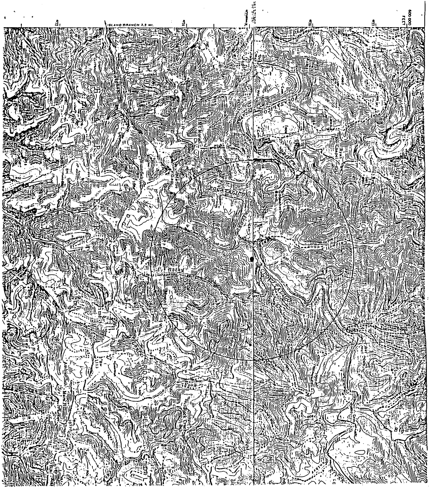
Well Location Map UIC Permit No. UIC2D0871926